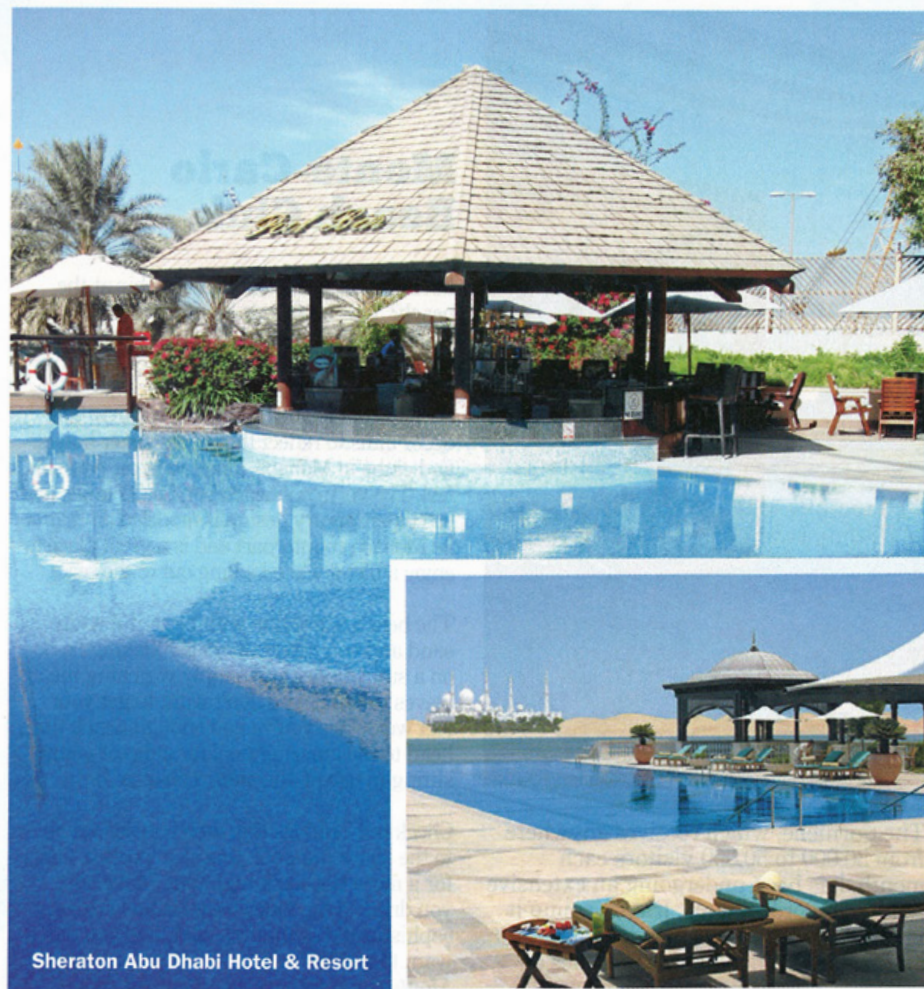
Sheraton Abu Dhabi Hotel & Resort