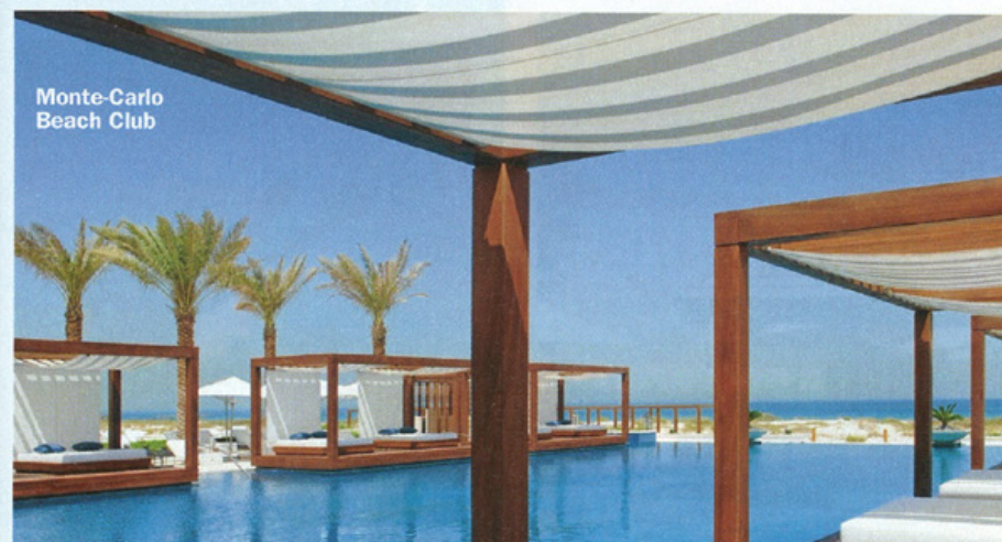
Monte-Carlo Beach Club