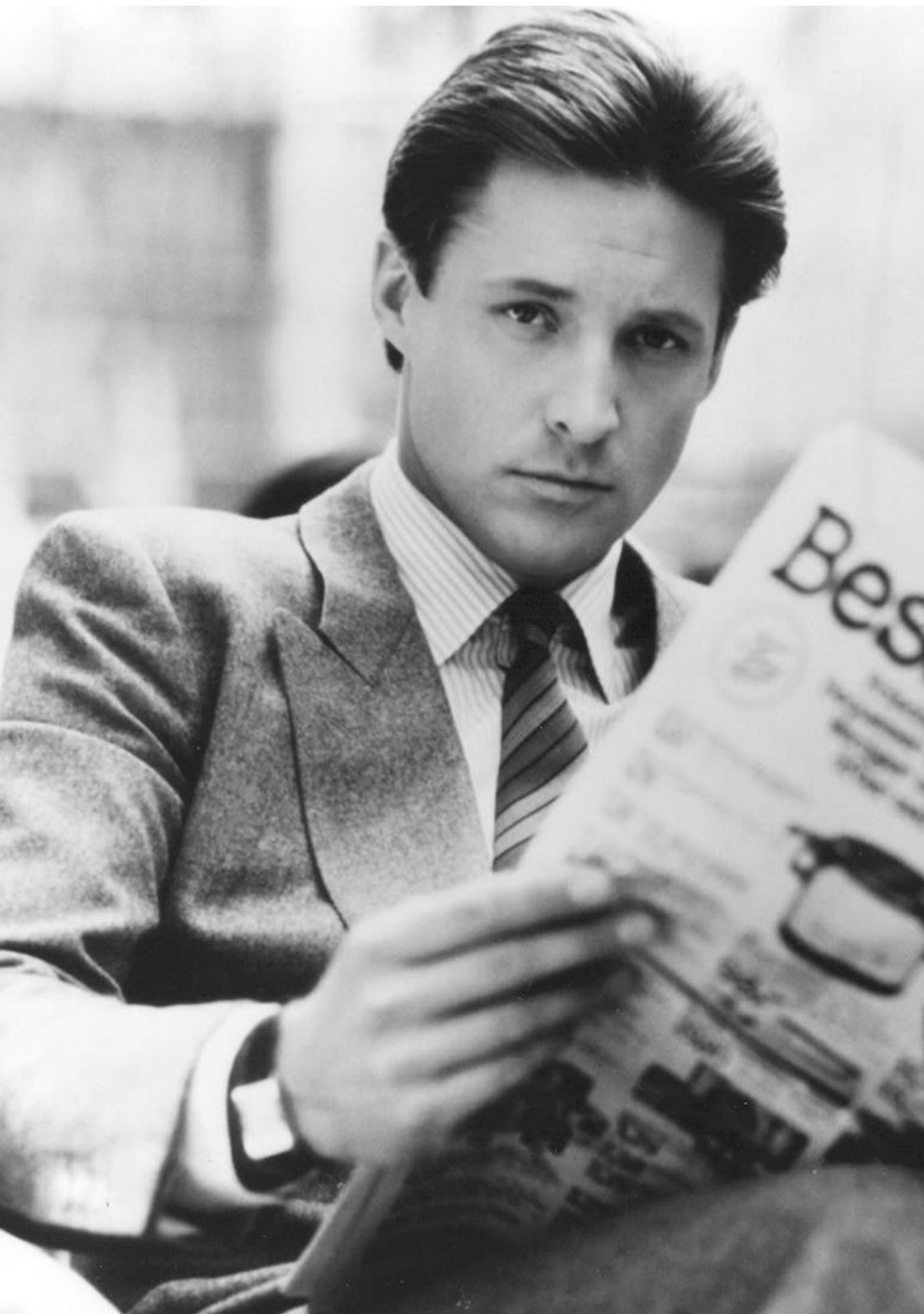
BOXLEITNER BECAME A HOUSEHOLD NAME PLAYING AGENCY OPERATIVE LEE STETSON IN THE TV SERIES SCARECROW & MRS KING

To revisit a character some 27 years later is quite amazing and it's not something we get to do very often