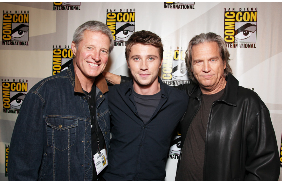
BOXLEITNER, GARRETT HEDLUND AND JEFF BRIDGES AT COMIC-CON. ASIDE FROM TRON, BOXLEITNER IS BEST REMEMBERED FOR STARRING IN THE ACCLAIMED TV SERIES BABYLON 5