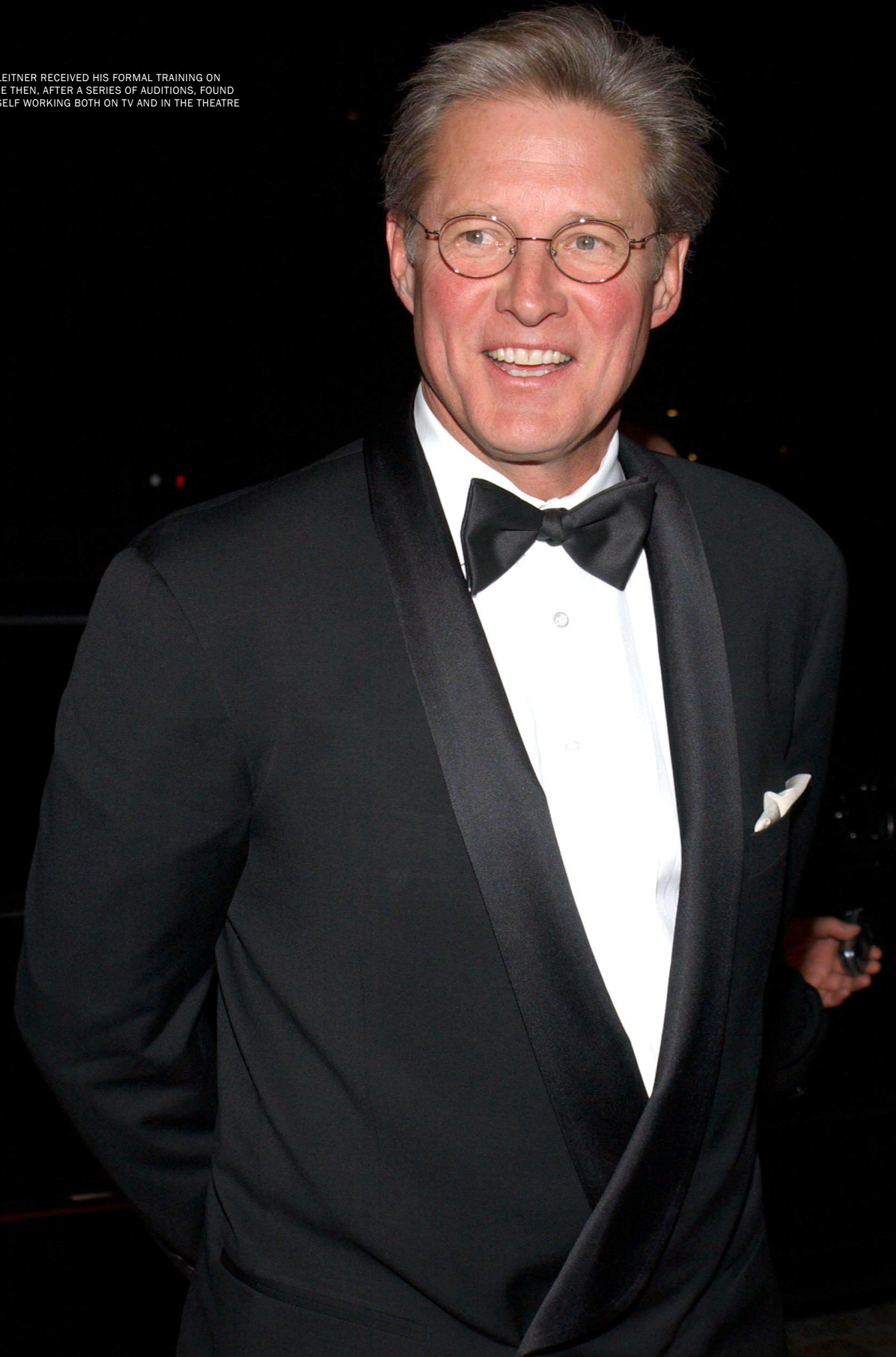
BOXLEITNER RECEIVED HIS FORMAL TRAINING ON STAGE THEN, AFTER A SERIES OF AUDITIONS, FOUND HIMSELF WORKING BOTH ON TV AND IN THE THEATRE

"They understood it more compared to the adults at that time who didn't get it. The kids