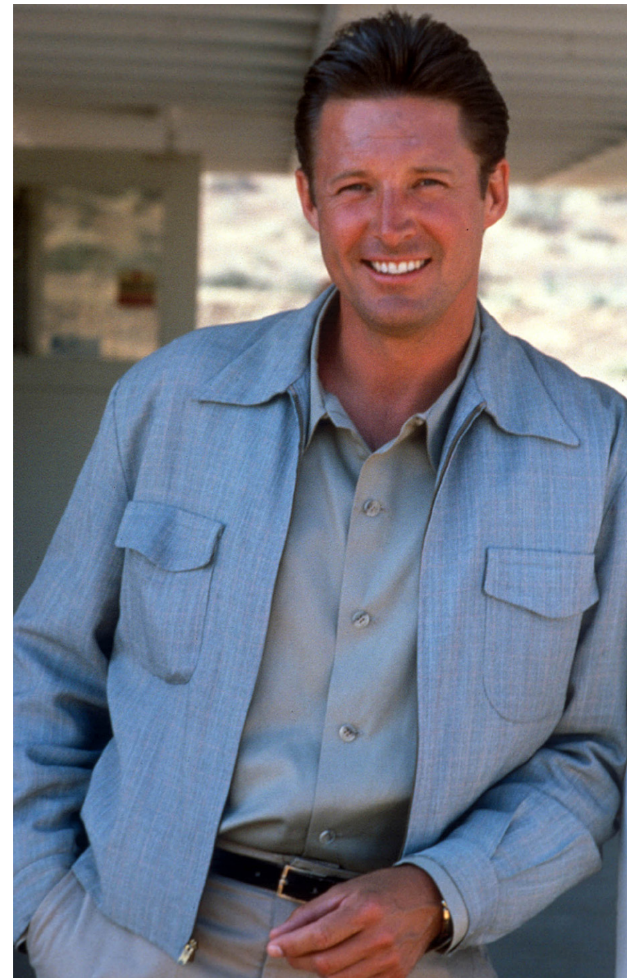
A STYLISH, SQUARE-JAWED ICON OF THE 80S, BOXLEITNER BECAME A SOUGHT-AFTER ACTOR FOLLOWING TRON

"Imagine someone throwing a Frisbee right at your head, very hard and he was up on a ladder and he really threw this thing down at me. And this was one shot I think he