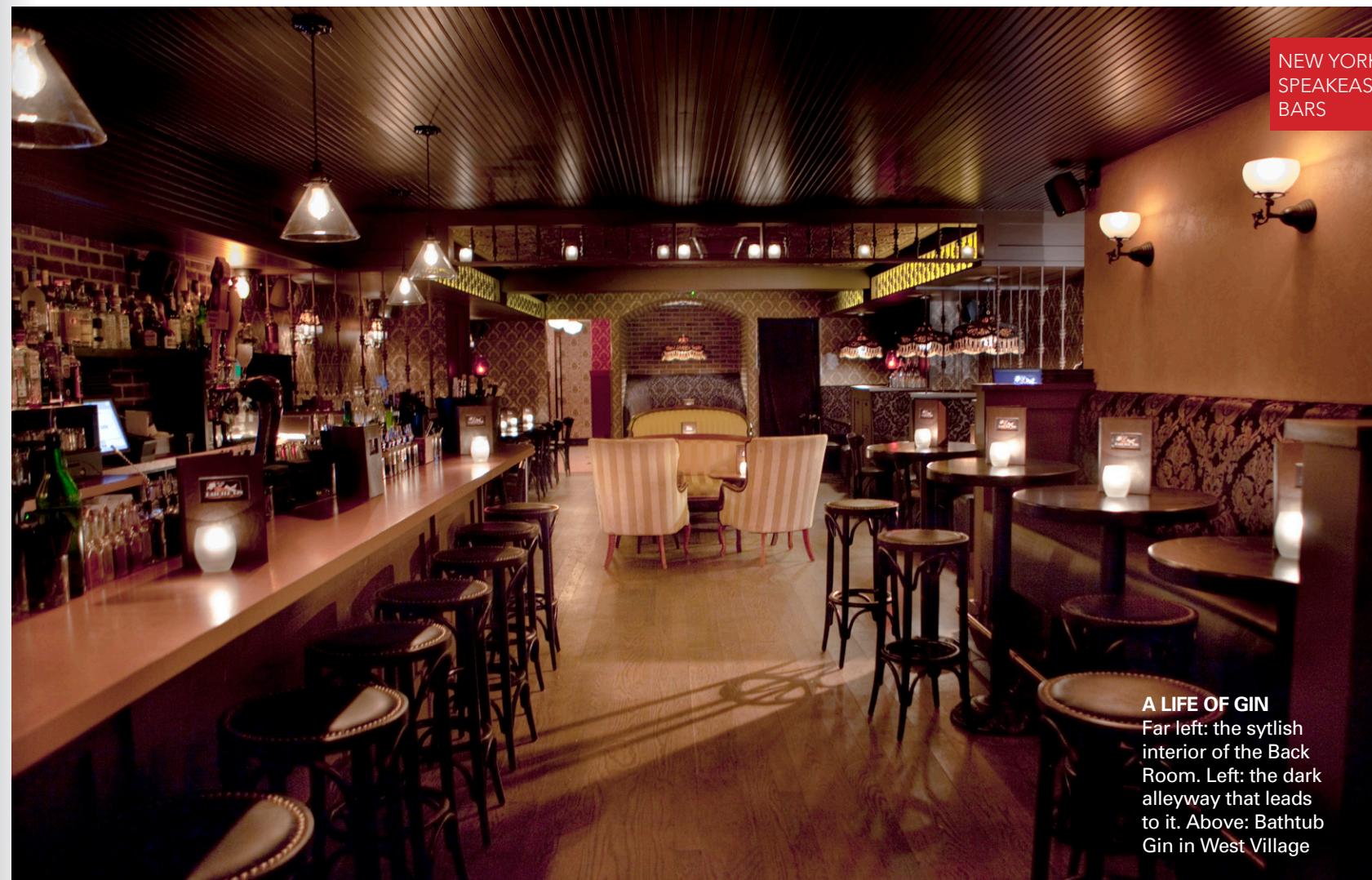
A LIFE OF GIN Far left: the sytlish interior of the Back Room. Left: the dark alleyway that leads to it. Above: Bathtub Gin in West Village

Should you time your visit for the first Monday of the month, you can take part in